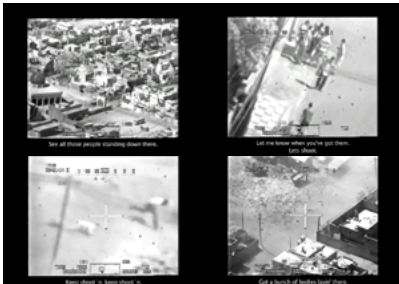
Photogramme extrait de la vidéo Collateral Murder , 2010