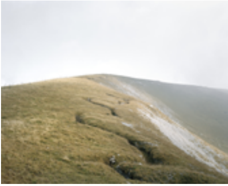
Paola De Pietri, Monte Fior , 2008, série To Face © Paola De Pietri, Courtesy of the artist