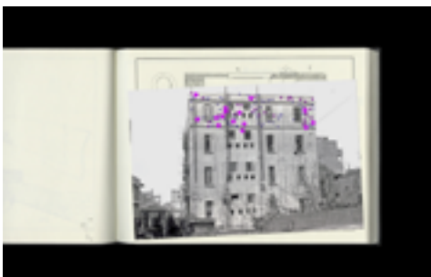
Walid Raad/The Atlas Group, Let's Be Honest, The Weather Helped, Plate_Iraq, 1998-2006