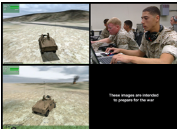
Harun Farocki, Serious games 4 : A Sun with no Shadow , 2009-2010