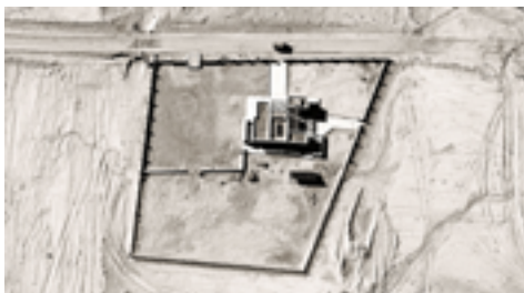
Jananne Al-Ani, Aerial IV , extrait du film Shadow Sites II , 2011 © Jananne Al-Ani, Courtesy of the artist