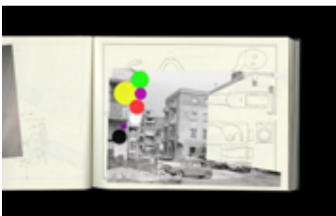
Walid Raad/The Atlas Group, Let's Be Honest, The Weather Helped, Plate08_Finland, 1998-2006