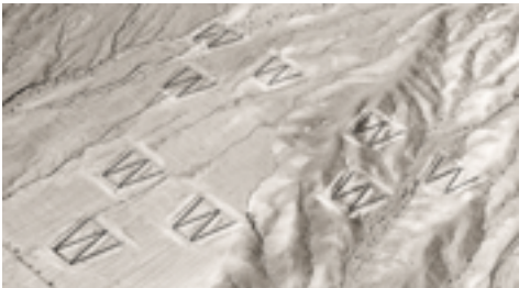
Jananne Al-Ani, Aerial I , extrait du film Shadow Sites II , 2011