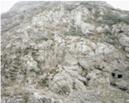
Paola De Pietri, Pal Piccolo , 2009, série To Face © Paola De Pietri, Courtesy of the artist