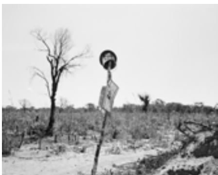
Jo Ractliffe, On the road to Cuito Canavale IV , 2010 © Jo Ractliffe, Courtesy of the artist and STEVENSON, Cape Town and Johannesburg